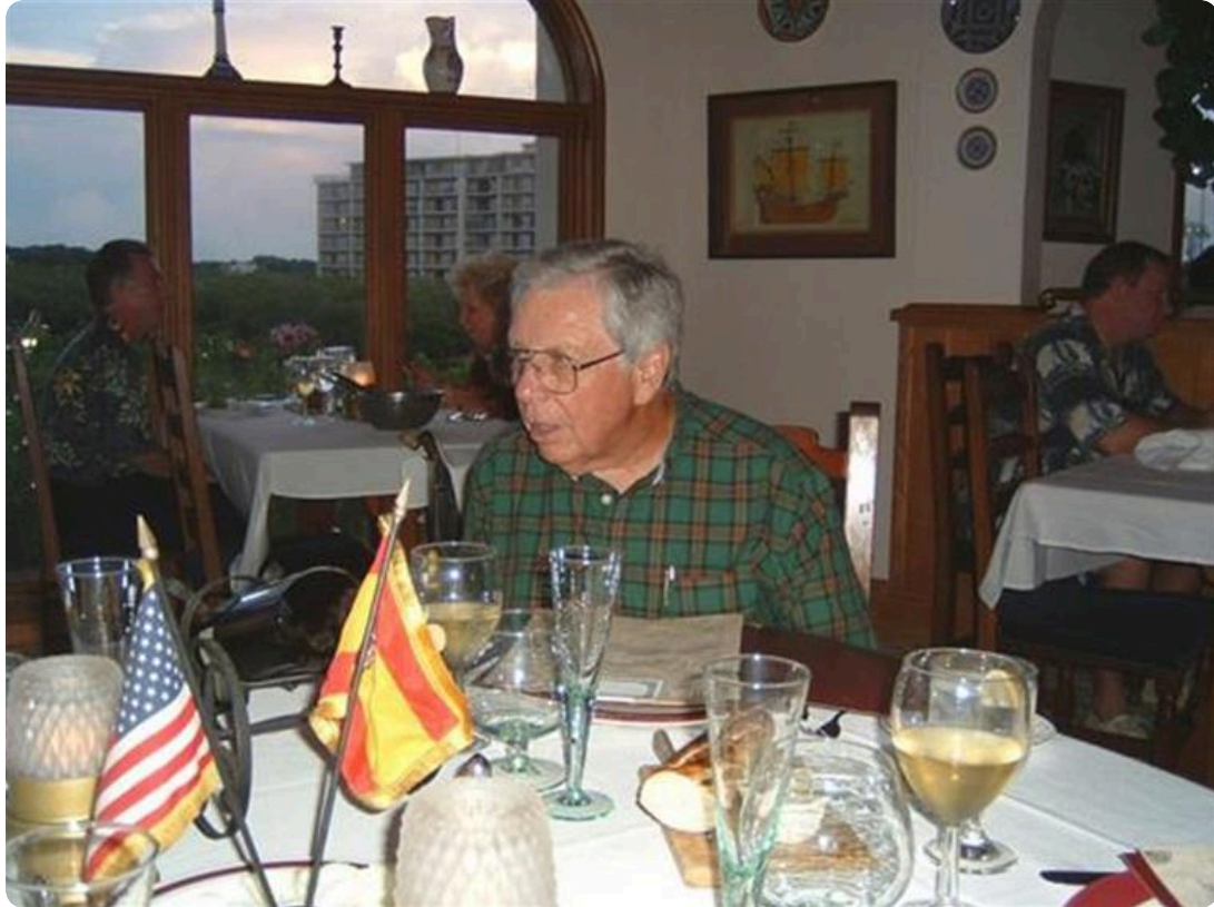
2003 at CM