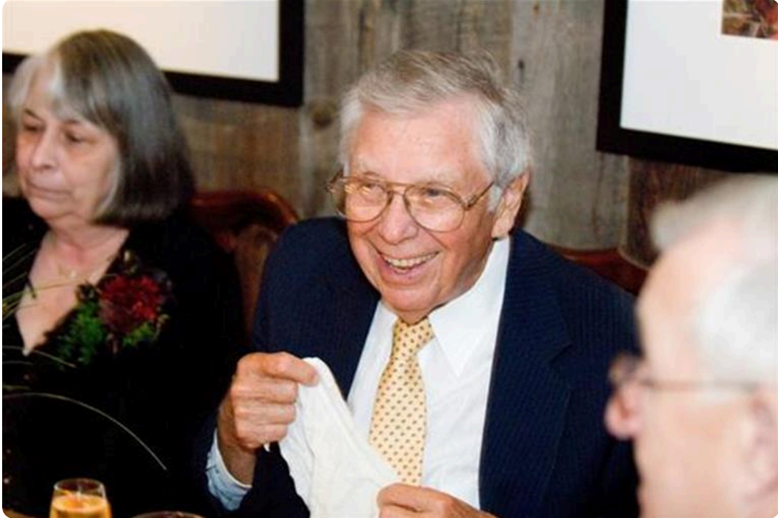
Loved a good story and a hearty laugh